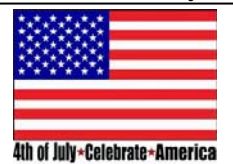
4th of July - Celebrate - America

The Western Recorder requested an early submission, therefore financial figures and attendance totals for June 22 will be included in next week's newsletter dated July 2.